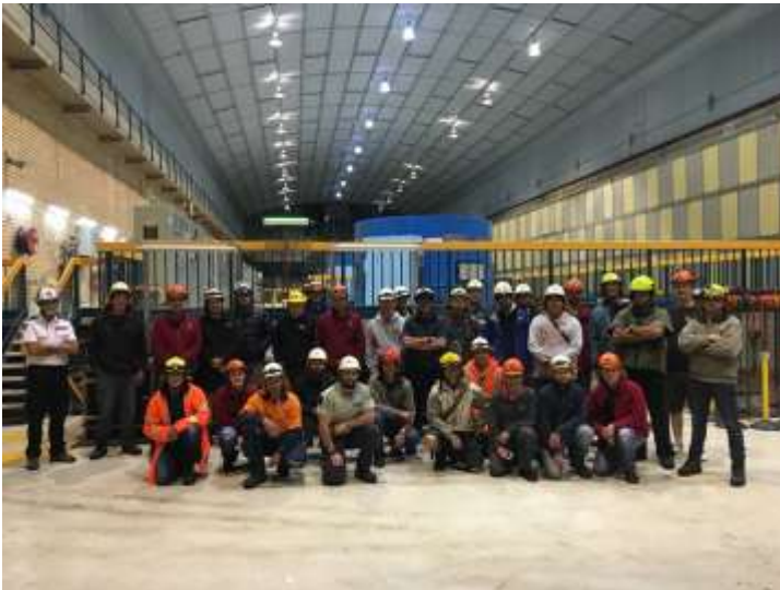
Photo: Taskforce Delta - Wet day visit to the Gordon River power station, 200m underground.