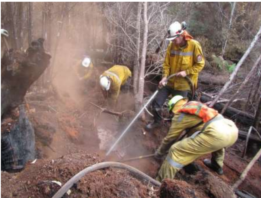
Photo: Taskforce Charlie hard at work digging up hot spots.