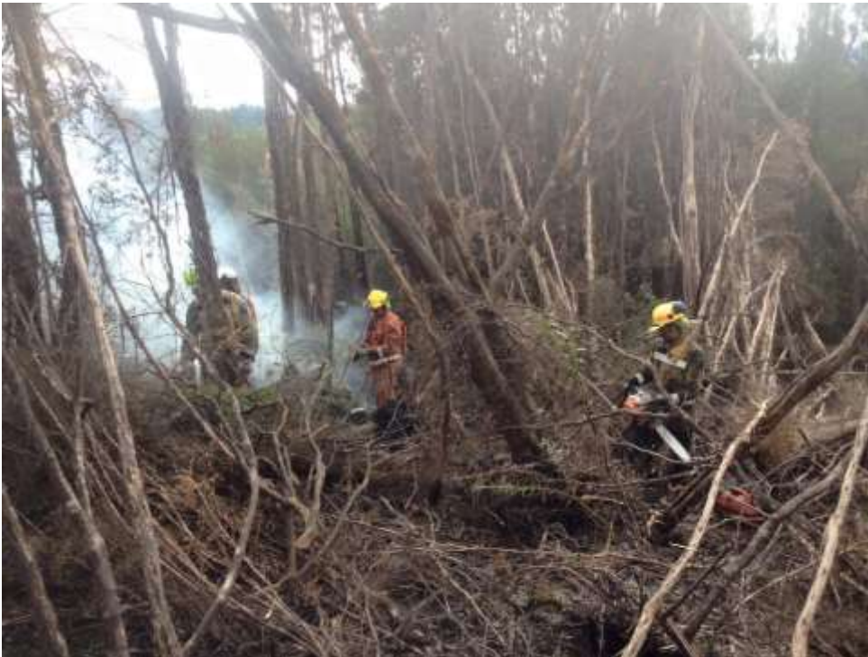
Photo: Perimeter security. Tight scrub, very similar to NZ bush.