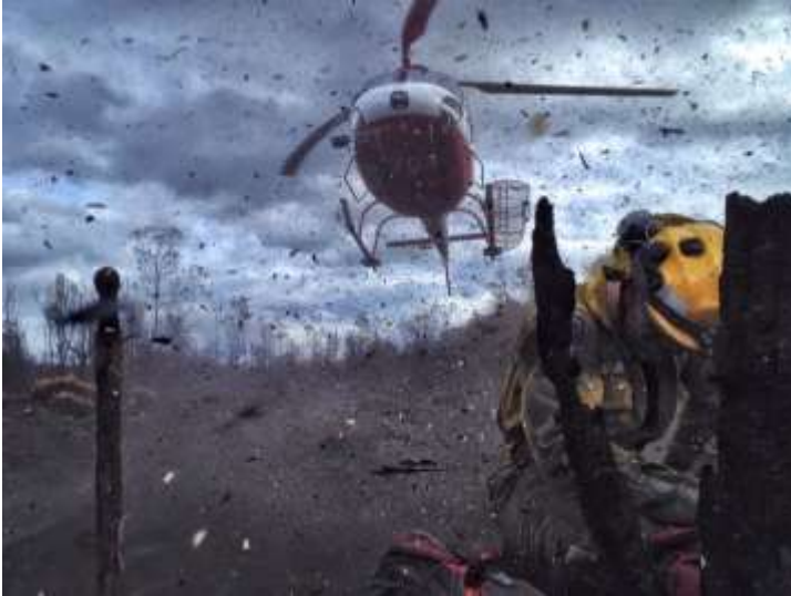
Photo: This is why we wear goggles.