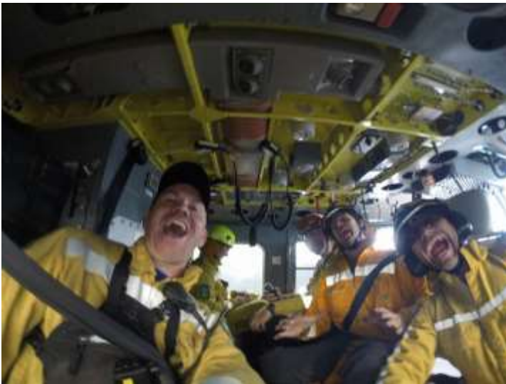
Photo: Good to see Taskforce Delta's sense of humour is still intact!