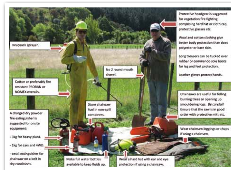
IMAGE: Basic Fire Equipment - Forest owners will have some basic equipment at hand for every-day work.

If you intend to deal with a smaller fire yourself, you'll need suitable clothing and hardware. Safety is extremely important in fire fighting. Synthetic clothing (overalls, trousers, shirts, jackets and underwear) melt if exposed to radiant or direct heat. This can happen even under a layer of cotton or wool. Natural fibres are better for fire fighting. Leather gloves and sturdy footwear are a 'must'. People with bare feet or jandals should not be allowed onto the fireground. Send them out of danger. Hard hats or woollen balaclava, eye protection, first-aid kit and clean drinking water are also necessities for fire fighting. If a forest owner has any doubts about fighting the fire, leave it to the Rural Fire Authority.