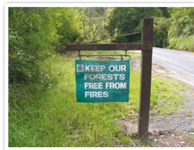
IMAGE: A gram of prevention is worth a kilogram of cure as far as forest fires are concerned.

A sample 'Fire Response Schedule' appears in the section 'Preparing for Fire'. We strongly advise forest owners to use this Fire Response Schedule to make a similar template for their forest to be sent to their local Fire Authority, neighbours and first response fire crews.