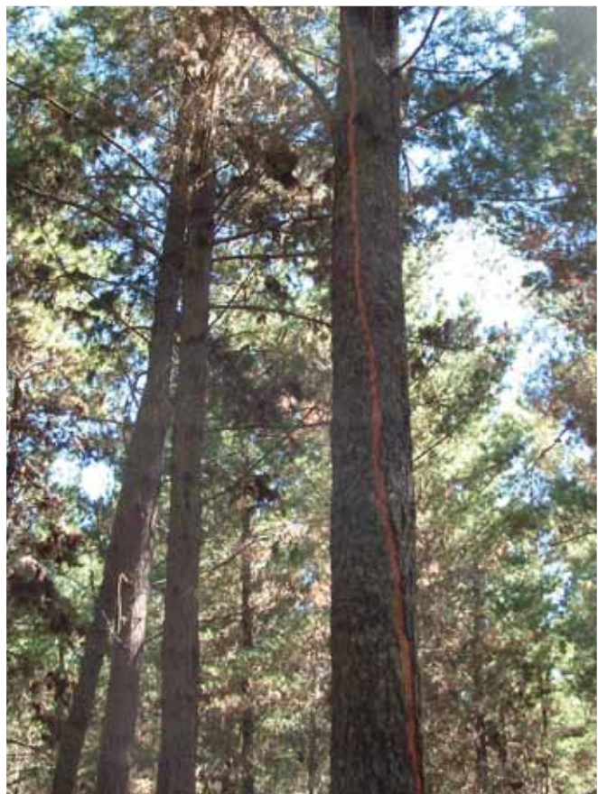
IMAGE: This lightning strike on the above mature tree resulted in a small fire because of dead plant material on the forest floor.

Lightning strikes can happen in warm dry weather with the passage of cold fronts. While there is nothing to stop lightning from starting a fire, some of the ideas above will help to reduce the amount of fuel, and therefore limit the seriousness of the fire.