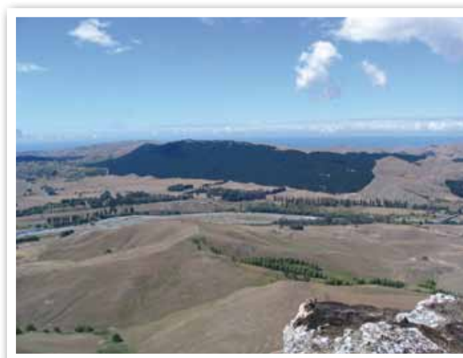
IMAGE: You are more likely to require larger insurance in warm dry localities with strong summer winds and many people close by or using the forest illegally.

See Appendix 4 for things to think about when selecting insurance.