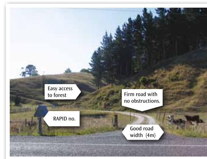
IMAGE: Fire preparation - This forest access has a RAPID number clearly visible, a name on the letter box (other side), good road width and grade, no overhanging vegetation and easy access to the plantation for fire vehicles.

If a dam is made, the regional council may need to be consulted prior to construction, depending on water volume held or catchment area.