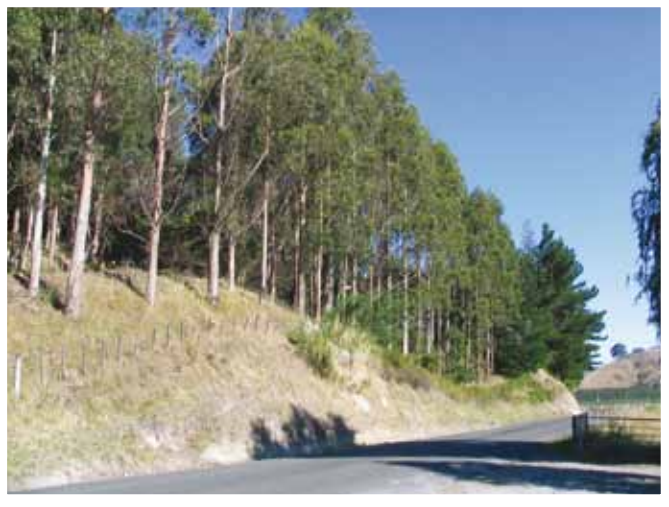
IMAGE: Close-cropped roadside grass below these pruned stems makes for better fire protection than the site further down the road.

A forest property that looks untidy is a more likely target for arsonists than a well-kept and well-managed one.