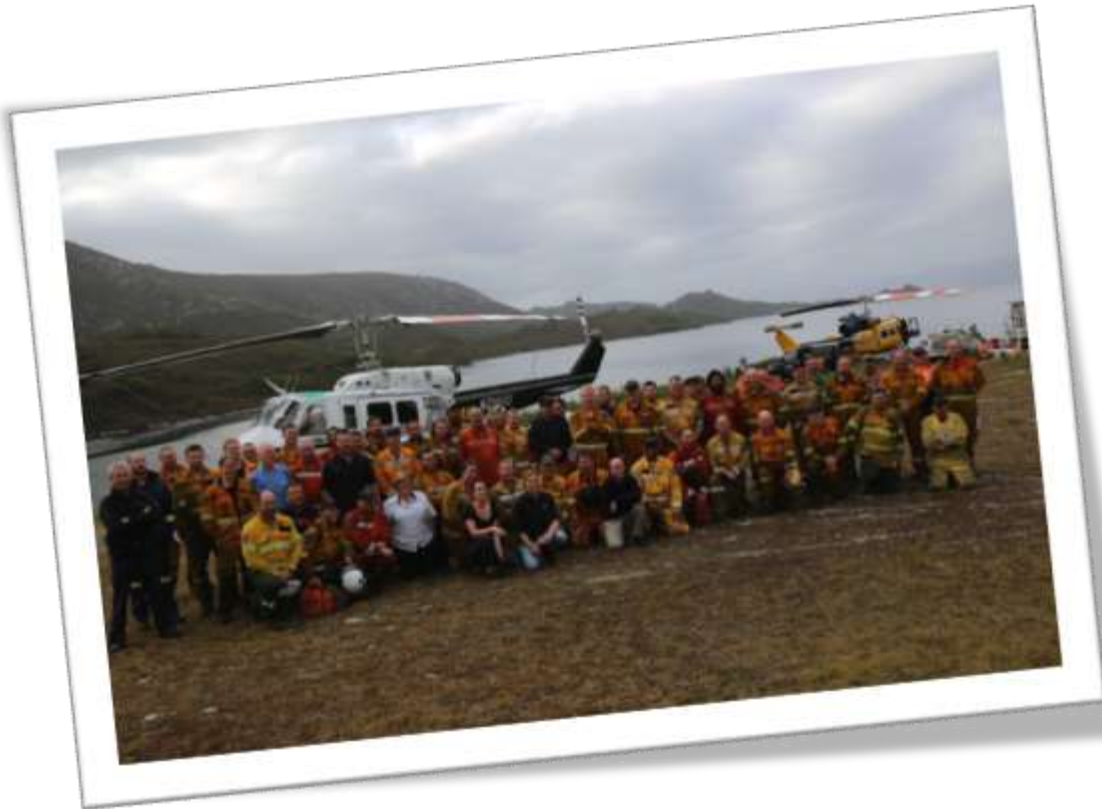
Photo: Personnel at Strathgordon