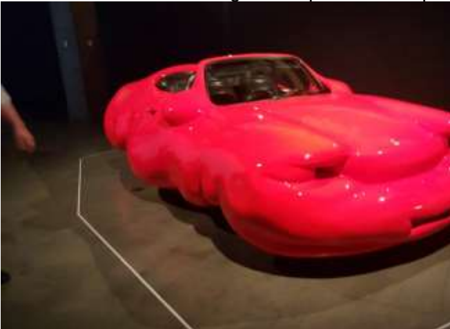
Photo: Fat car at the Mona Art Gallery.

After catching up on sleep, members of the crew visited local cafes and 'lemonade stands', and took the opportunity to visit the Mona art gallery (see picture below), and visit the Hobart races. Some crew members even managed to squeeze in a spot of fishing.