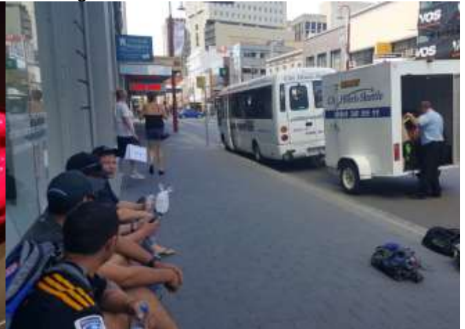
Photo: Southern-based crew getting ready to head back to Strathgordon (a 2.5 hour drive from Hobart).