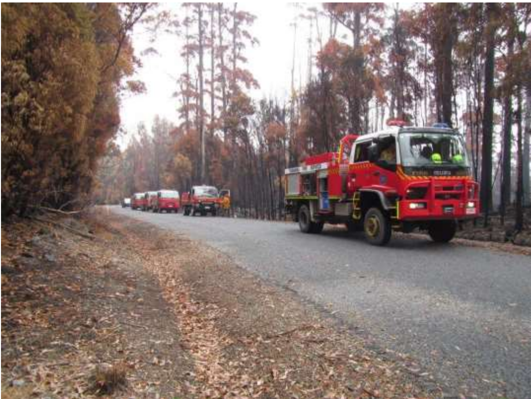
Photo: Taskforce Charlie crews working to assess and treat hazard trees along a public road.