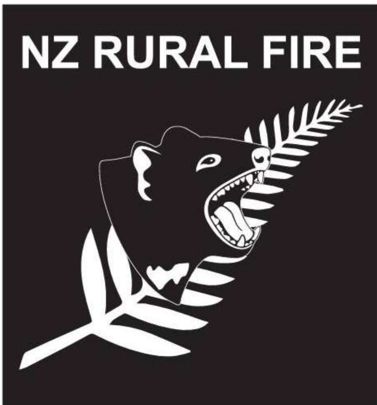
Photo: Art work the crews have come up with for a deployment T-Shirt!