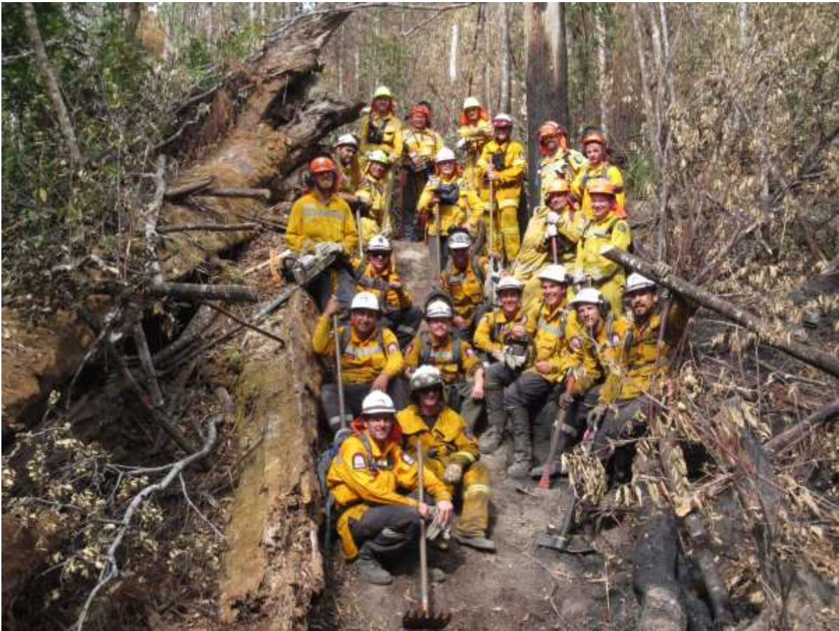
You could drive your car on this hand line the crew put in with hand tools only - and they're still smiling!