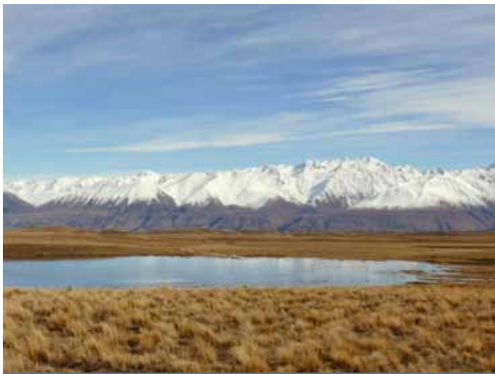
Image taken in the Mackenzie region.